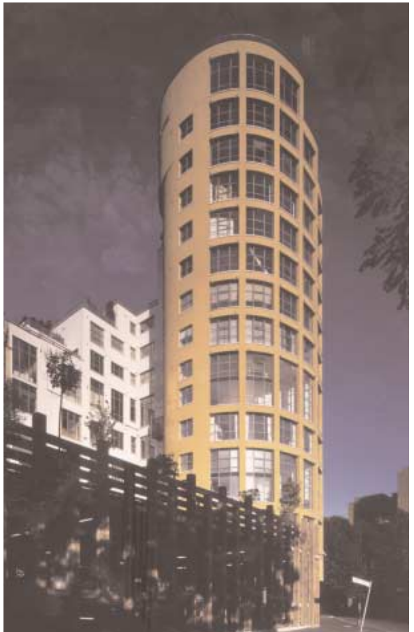
Bankside Lofts, London SE1 Architects: CZWG